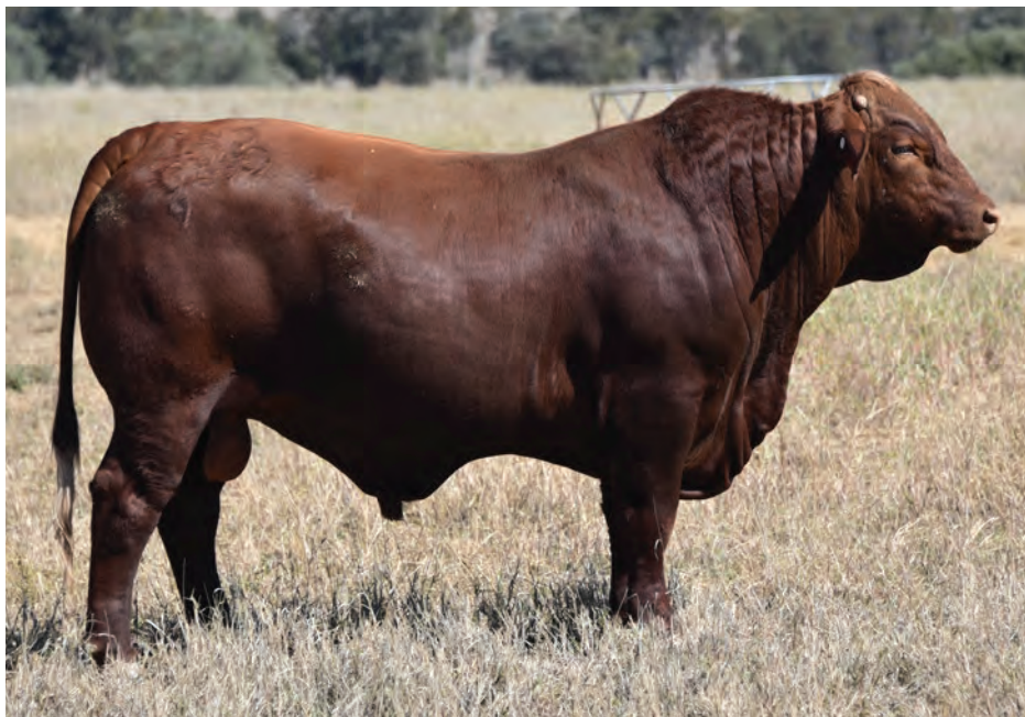
SB No: DAN19MC390 Tattoo: C390 DOB: 5.03.2019 Age: 30 mths S Bull

WACO JACK (P) DANGARFIELD JACK JUNIOR (P) DANGARFIELD 3107 (P)