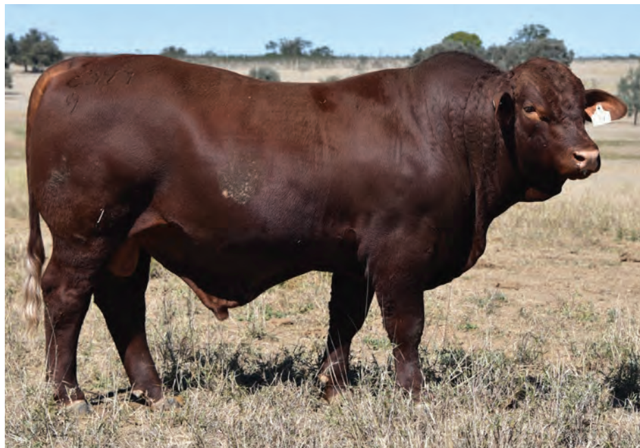
SB No: DAN19MC397 Tattoo: C397 DOB: 3.03.2019 Age: 30 mths S Bull

CANOWINDRA GOLD EDITION BULLAMAKINKA JAGUAR KELLY WALLAH Z21